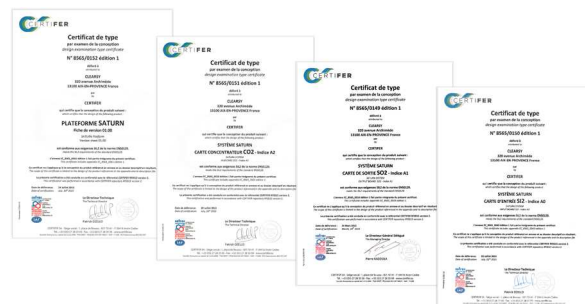
■ SIL2 certificates

The SATURN platform can be expanded by adding self-contained or custom I/O modules to match any application requirements.