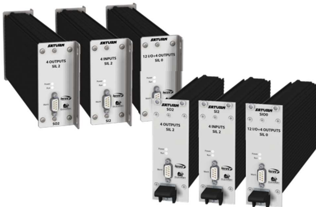
■ SATURN Safety modules