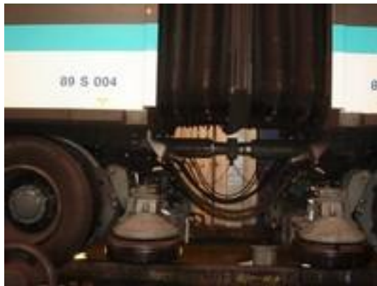
General view of 2 wagons and their bogies