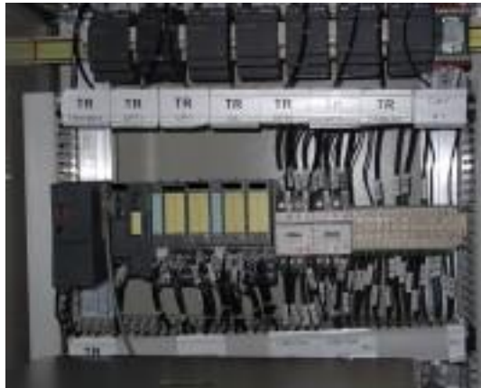
Automatons situated in the Ground DOF1 cabinet.