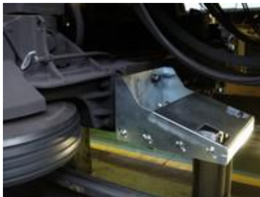
Onboard DOF1 loop antenna prototype fixed onto the bogie