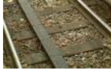
Example of the track Belt